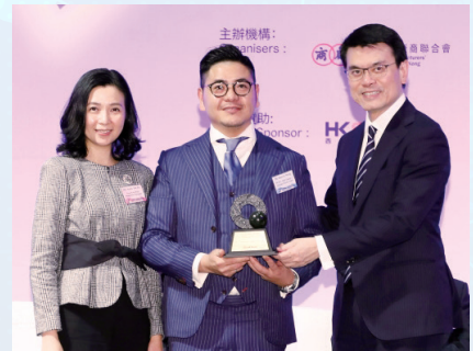
PCCW – HKT Limited – Customer Service Center