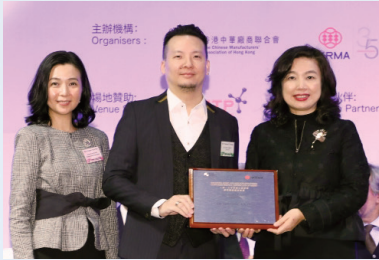
City Super Limited – LOG-ON