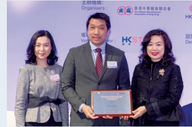
昂坪360有限公司 Ngong Ping 360