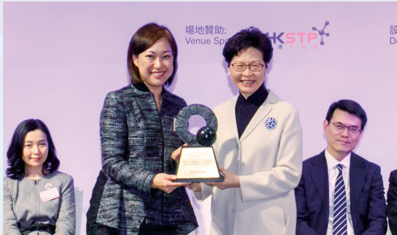
渣打銀行(香港)有限公司 - 個人金融業務 Standard Chartered Bank (HK) Ltd – Retail Banking

Award Presenter: Mrs. Carrie Lam, Chief Executive, HKSAR