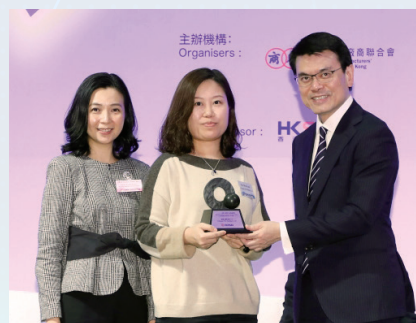
通域存網有限公司 UDomain Web Hosting Co Ltd