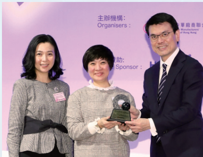
香港航空地面服務有限公司 Hong Kong Aviation Ground Services Ltd

Mr. Edward Yau Tang-wah, GBS, JP, Secretary for Commerce and Economic Development, HKSAR (Right)