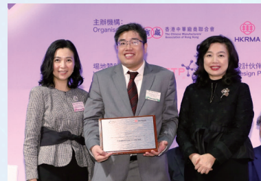
浩欣國際投資有限公司 - 神彩飛揚 YHY International Investment Incorporation Ltd – God's Rainbow