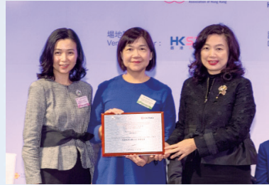
香港電訊有限公司-香港電訊 Hong Kong Telecommunications (HKT) Limited – HKT