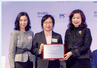
卓健醫療服務有限公司 Quality HealthCare Medical Services Ltd