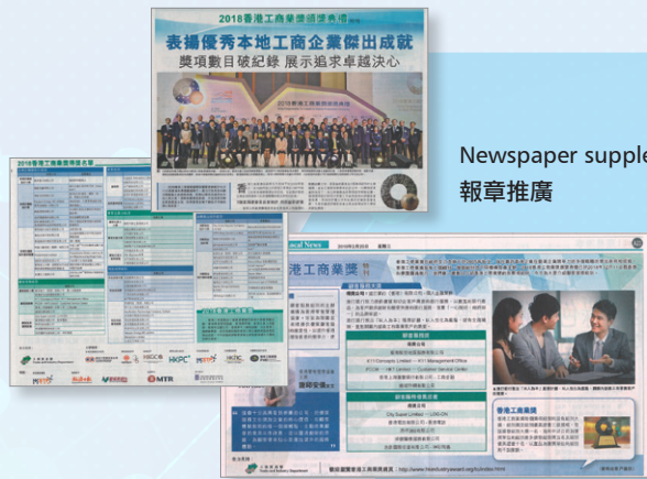
Newspaper supplement 報章推廣