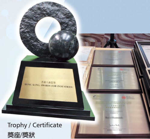
Trophy / Certificate 獎座/獎狀