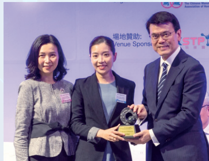
K11 Concepts Limited – K11 Management Office