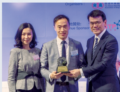
香港上海滙豐銀行有限公司 - 工商金融 The Hongkong and Shanghai Banking Corporation Limited – Commercial Banking