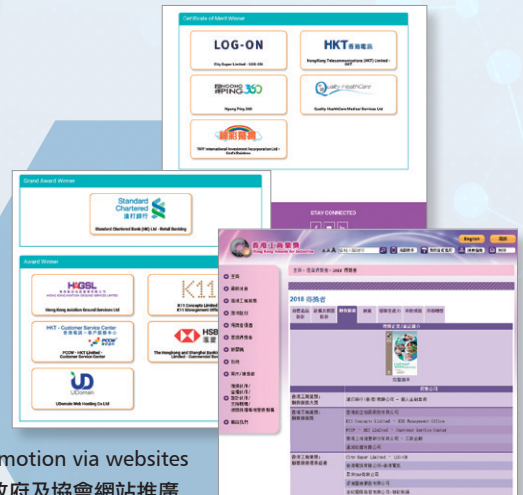
Promotion via websites 於政府及協會網站推廣